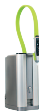
PURELAB flex 3&4