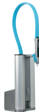
PURELAB flex 1