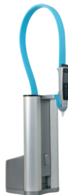
PURELAB flex 1