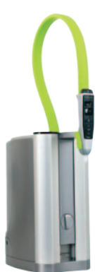
PURELAB flex 3&4